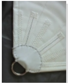
Strapped-in rings for ultimate durability.