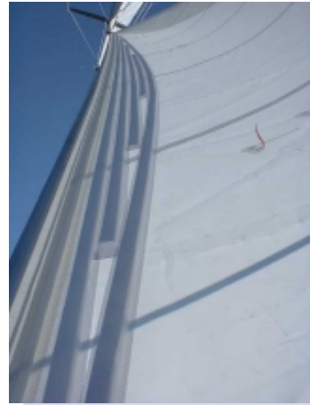
Sailing view of the Multi-Track Foam Luff

The Multi-Track Foam Luff System offers another unique advantage: on traditional foam luff systems with a single ply foam, the pad becomes permanently distorted after it has been rolled up for any period of time. Our Multi-Track System is made up of individual one inch foam strips which provides total furling flexibility without ever distorting the foam or sail shape.