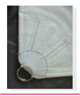
Strapped-in rings for ultimate durability.