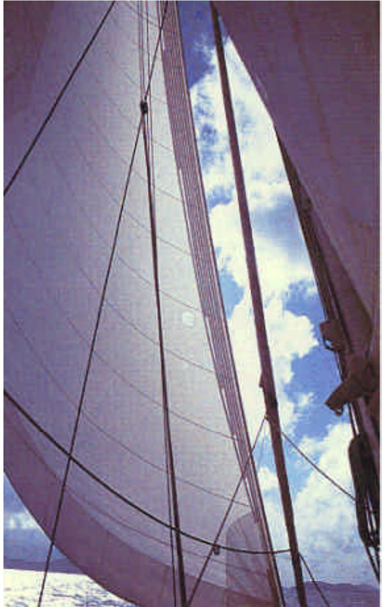
The Multi Track Foam system is smooth in use and allows the sail to furl with a correct shape when the breeze comes up.

more precisely than any other luff furling system. Optimum shape maintenance means you lose little in performance when you reef your sail.